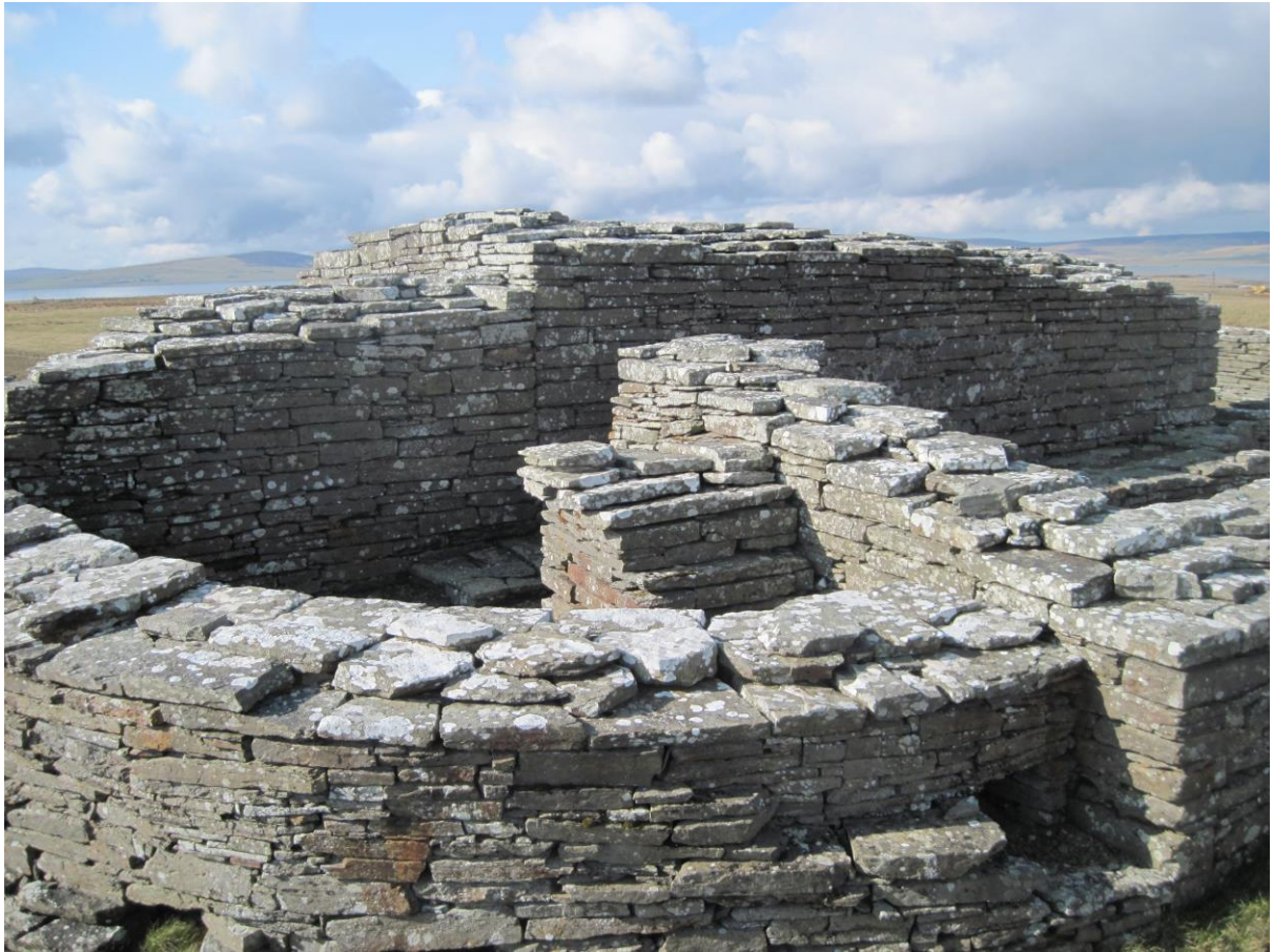
Fig. 1: Cubbie Roo's Castle, Wyre, Orkney.